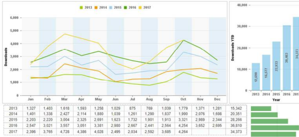
SEJ Growth in Downloads 2013-2016

The following report details the usage, CrossRef citations and authorship of SEJ. The report is limited to usage by customers. It therefore excludes search engine crawler usage, usage by Emerald staff, LOCKSS crawler usage and free usage.